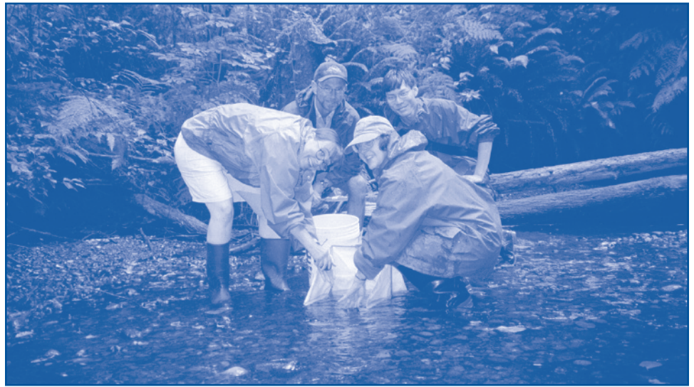
▲ Collecting bugs from the stream – knee boots recommended!