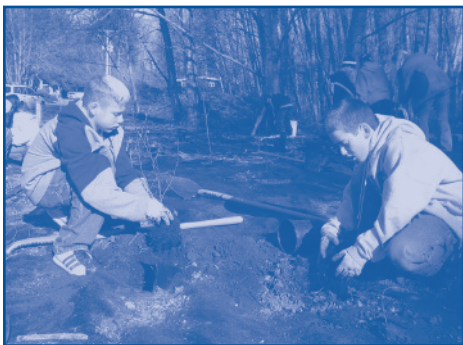
▲ Students help out at Mission Creek Planting Site.

Four B'nai Torah teens and two adults spent a windy Sunday in February planting native trees and shrubs next to Mission Creek. The teens dug holes in rocky soil full of massive blackberry roots to finish planting the streamside property that was once covered in 6 foot high blackberry bushes. Roosevelt, Lincoln, and McKenny Elementary School students have also planted trees and shrubs on the site. The B'nai Torah youth also spread woodchips to enhance the beauty of the site. The B'nai Torah teens get together once a month to do service projects; Sherri Shulman is the group leader.