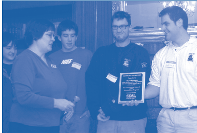
▲ "Volunteers of the Year" recognized at Stream Team's Annual Party.