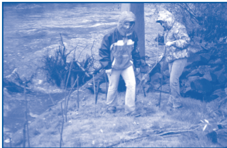
▲ Planting along the Deschutes River at Site 130.

On March 4, Stream Team volunteers finished the last phase of the Site 130 project by planting native shrubs along the Deschutes River at Tumwater Valley Municipal Golf Course. Nootka rose, snowberry, ocean spray, beaked hazelnut and other native plants were used along the upper bank to augment the willow and red-osier dogwood planted on the lower bank by volunteers last November.