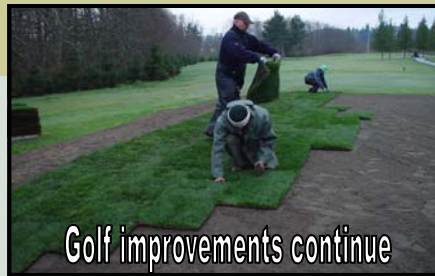
Golf improvements continue