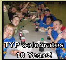
TYP celebrates 10 Years!