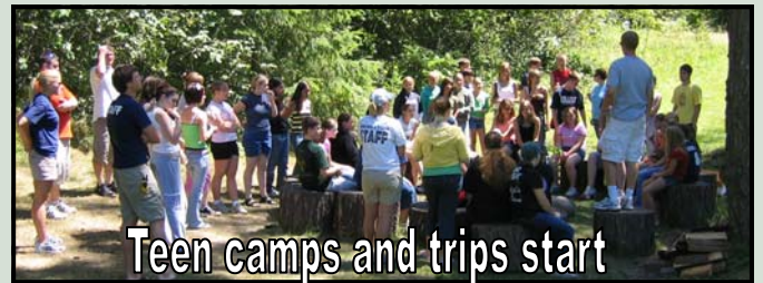
Teen camps and trips start