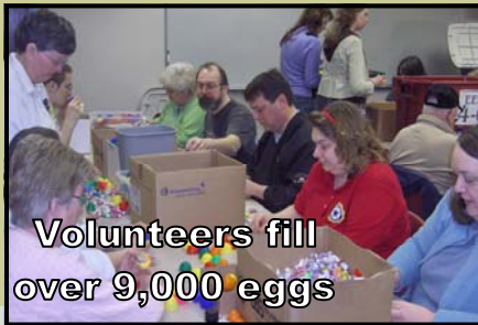
Volunteers fill over 9,000 eggs