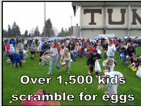
Over 1,500 kids scramble for eggs