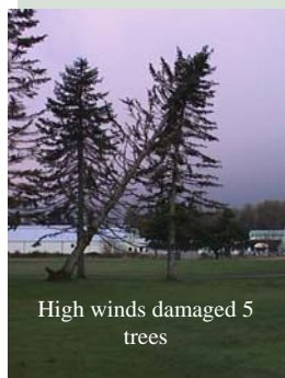
High winds damaged 5 trees

*Began preparing the course for spring and summer play-Training Staff, installing markers, pressure washing, painting, installing benches, ball washers and club washers, verti-cutting greens, sanding, replacing signs and lights, preparing equipment and mowers, receiving pro-shop inventory, and many other tasks to prepare for a busy 2005.